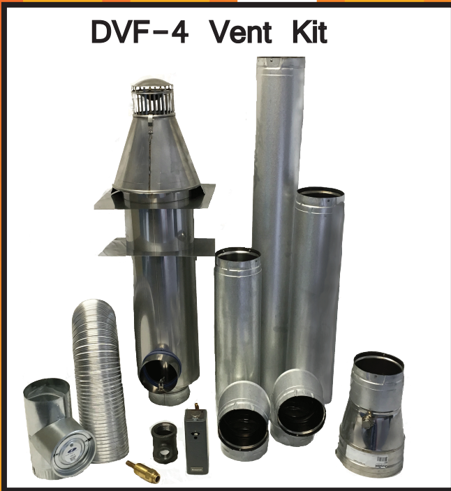
DVF-4 Vent Kit